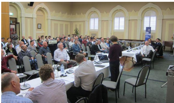
2013 Cycling Forum

In the mid-2010s, ITE-ANZ joined with AITPM and TAs to hold forums on transport issues in Geelong, Bendigo and Ballarat.