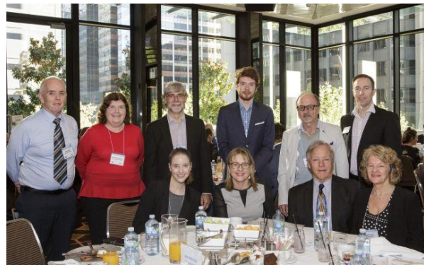
2022 Breakfast with Hon Jacinta Allan

Two of the biggest features of the ITE-ANZ calendar every year are the Breakfast Meeting prior to the AGM early in the year and the end-of-year President's Dinner. Both events are very well attended with up to 120 people and they are an excellent opportunity to socialise and network with transport professionals. Leading figures in transport are invited to speak at these events.