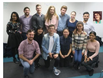
Inaugural YITE group

YITE has organised various events including webinars and a design competition.