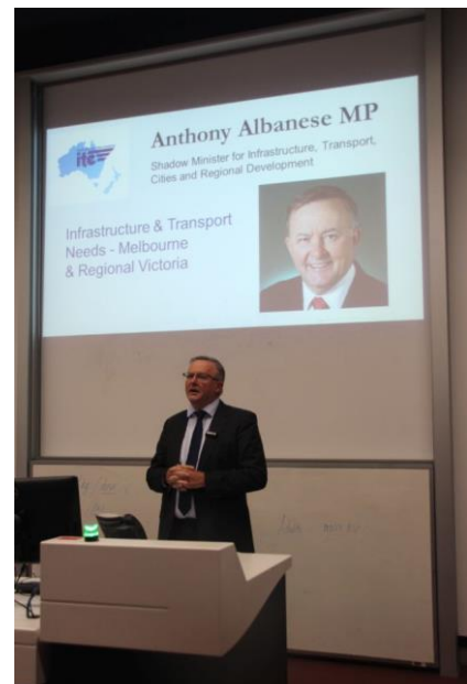
2017 Anthony Albanese MP

Over the years members of the Board have also provided expertise and knowledge to various committees and workshops which were considering traffic and transport issues.