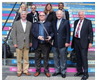
2015 ITE Study Tour