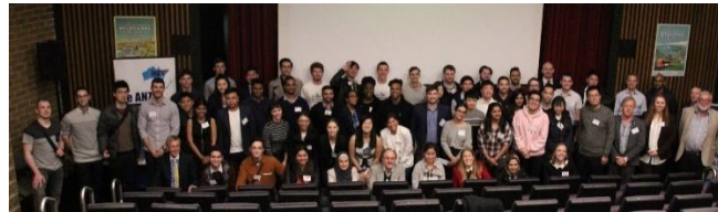
SLS and Traffic Bowl attendees