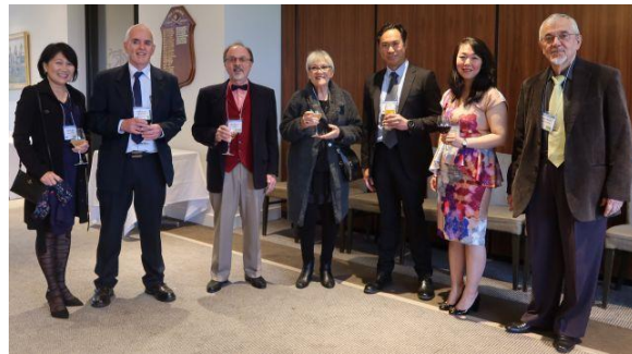
2022 President's Dinner with SIDRA