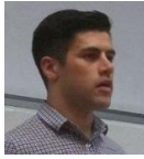
Manuel (Hong Kong)