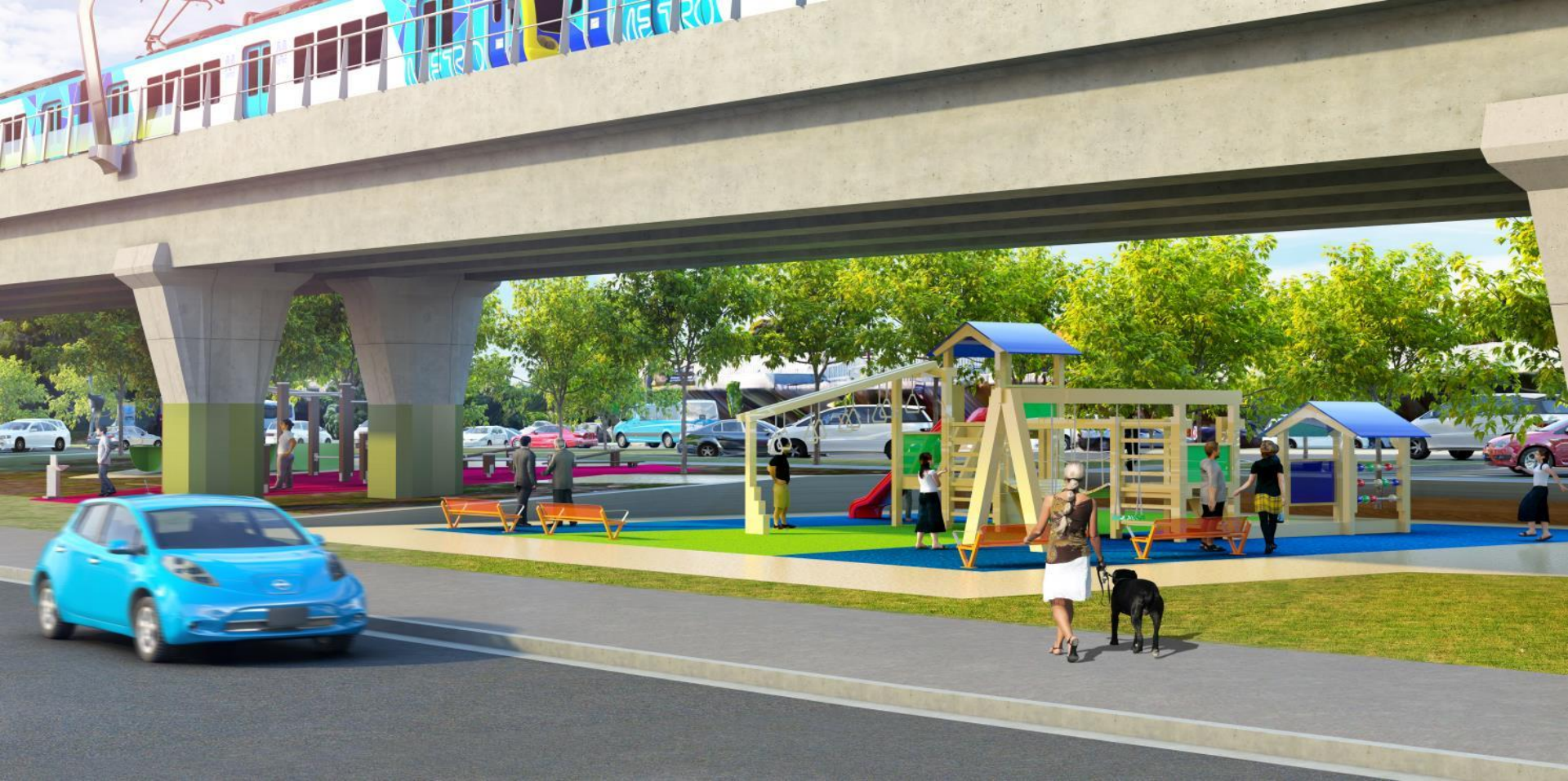
Activated Space - Chandler