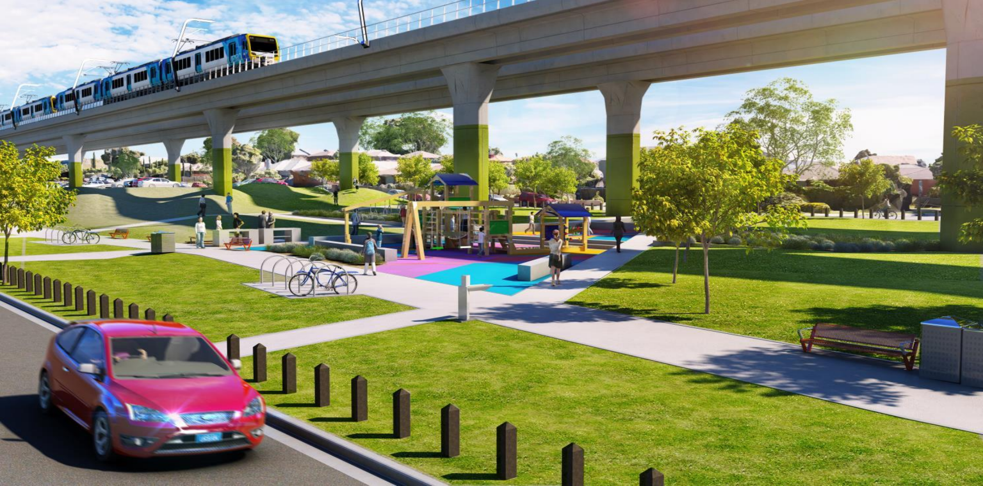
Activated Space - Clayton