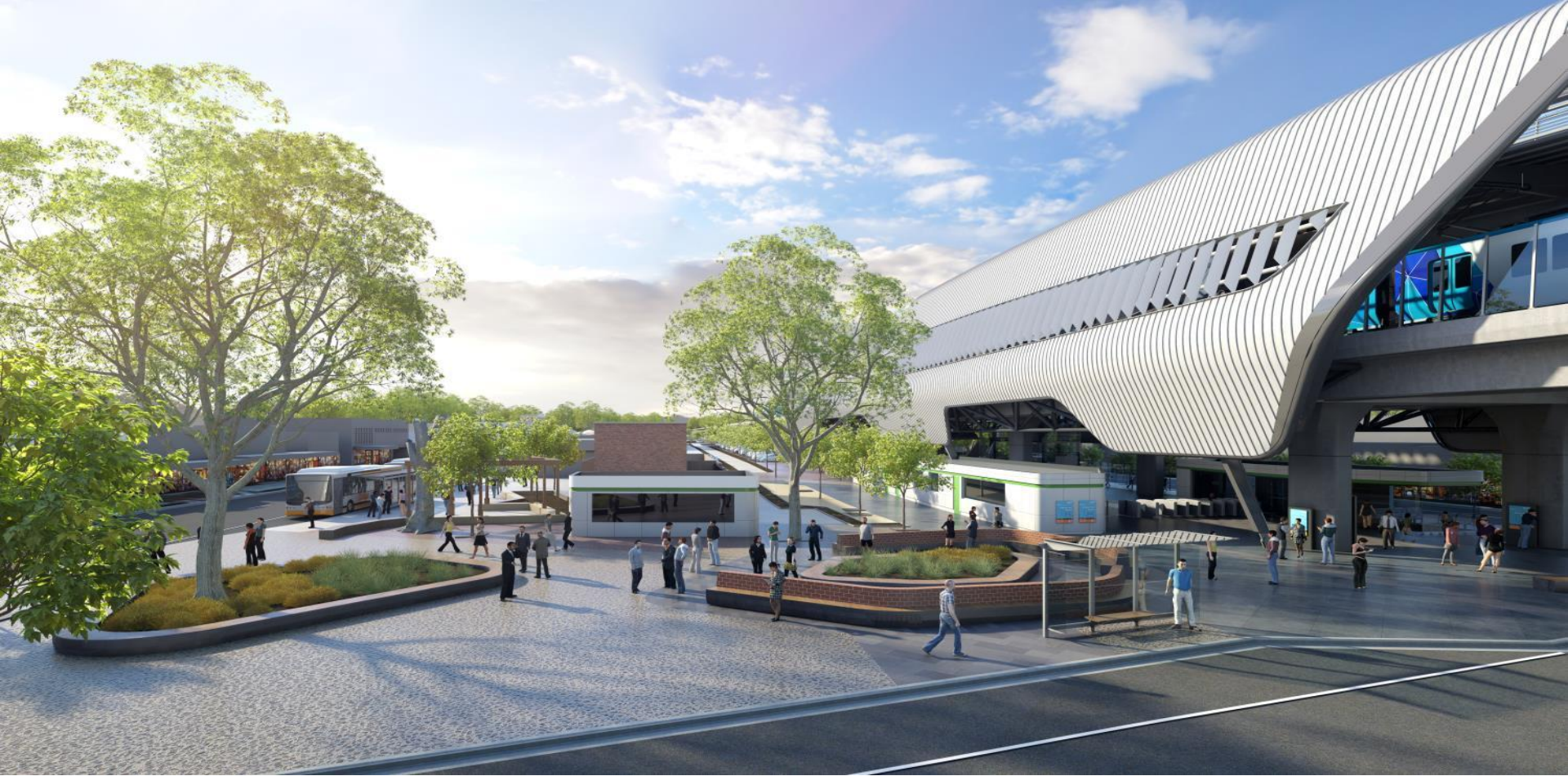
Noble Park Station