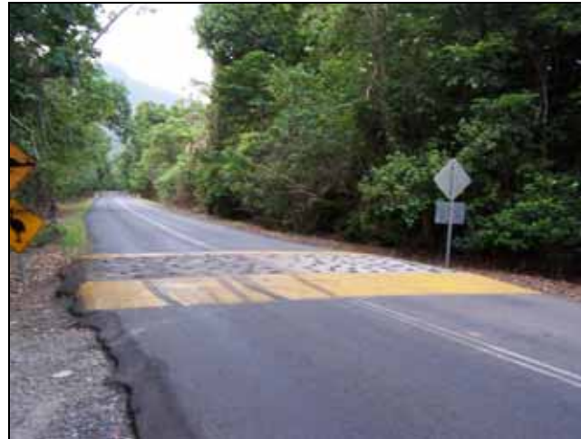
Speed humps are spread along the main road through the Daintree National Park.

to an astounding variety of wildlife, including a large flightless bird called a cassowary. These birds have an unfortunate habit of wandering across roadways as they forage. To reduce the instances where vehicles strike these birds, which often results in severe damage to both, the main highway has numerous speed humps in areas where cassowaries are known to range.