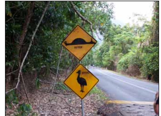
The Speed Hump/Cassowary warning signs after "Modification" by local residents

While ITEANZ does not encourage the alteration of road signs by the public – this particular form of community action does make for good T-Shirts – sold in all the local shops.