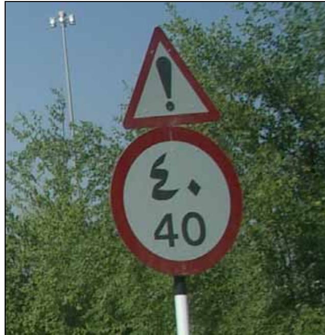
Speed signs in dual language in Abu Dhabi