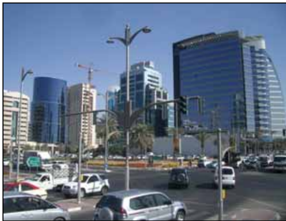
Traffic signal and lighting columns in Dubai