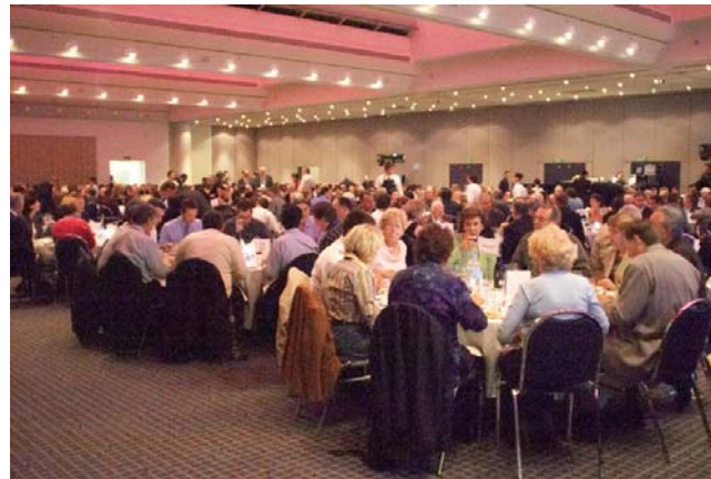
A packed house at the ITE 75 th Anniversary Dinner at the ITE AM & E in August 2005

members in Australia and New Zealand (currently under development – stay tuned) and an increased level of activity in focusing on local issues in the region. While the Executive Board is quite diligent in identifying relevant areas of interest we occasionally miss opportunities to participate to the public debate. If you are aware of an issue that you consider the ITEANZ would be able to contribute please advise any on the Executive Board so that we can prepare a suitable submission.