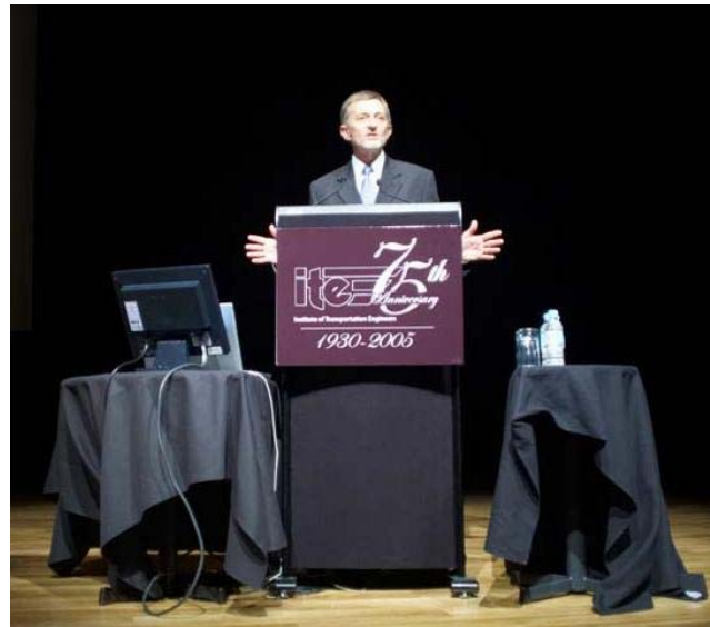
Victorian Transport Minister Peter Batchelor Opening the ITE AM & E